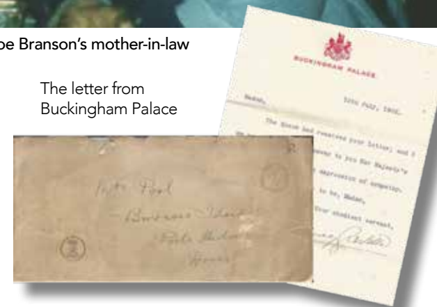
The letter from Buckingham Palace