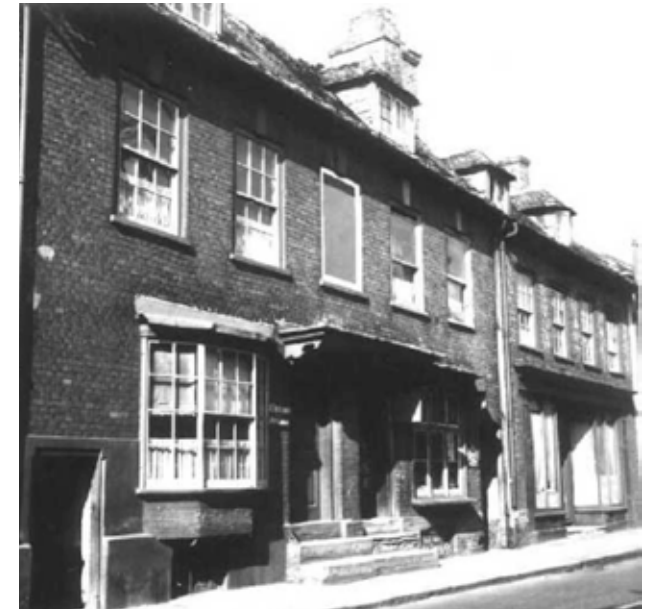
Old Shop, Poole High Street