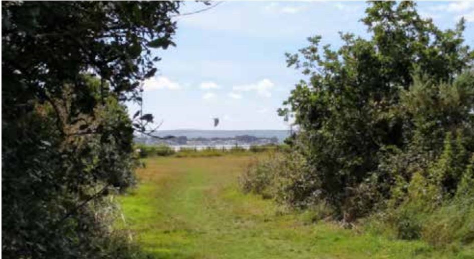
Luscombe Valley view