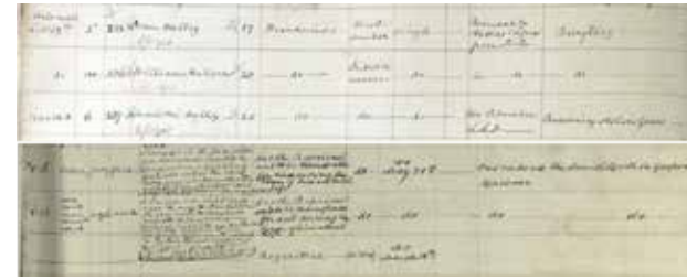
Dorchester Prison Admission record