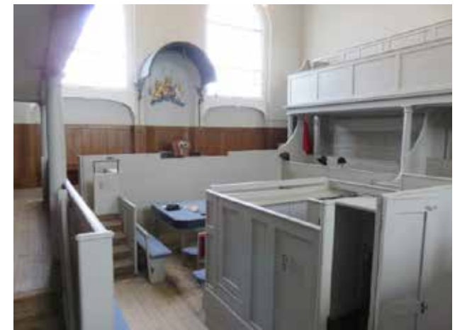
Courtroom, Shire Hall, Dorchester