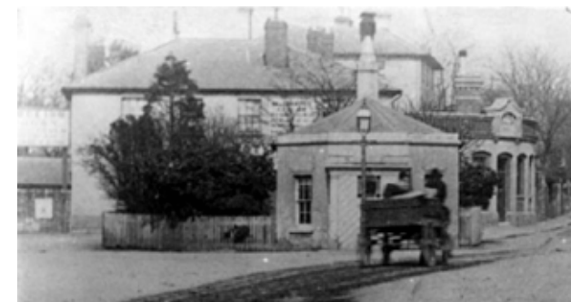
The old George Inn and toll house, Longfleet

Sailor, Air Balloon, Anchor and St. Clement in Poole and the George and New Inn in Longfleet.