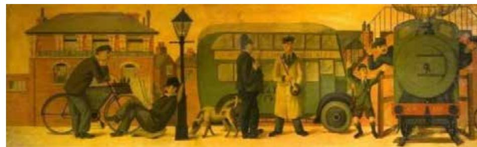
A scene from the frieze - waiting at the level crossing, High Street

by Cecil Todd of the Poole Art School and some of his students, depicting Poole scenes, public houses and local characters (described and explained in Andrew Hawkes' book A Pint of Good Poole Ale ). Several of the panels of the frieze are now in the Poole Museum. (see below) Only four years after the opening of the new London Hotel, the building was badly damaged during a bombing raid on Poole which destroyed the tailor's