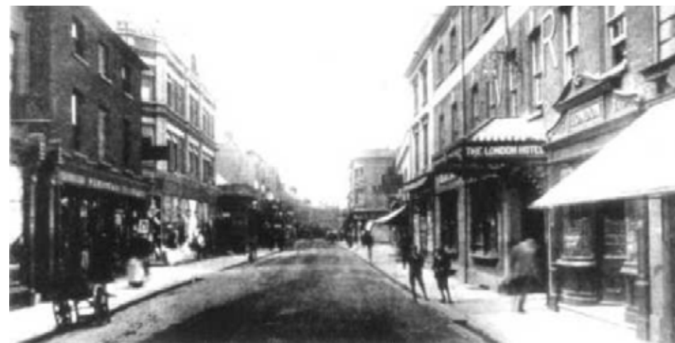
High Street with the London Hotel on the right, decorated for Queen Victoria's Diamond Jubilee

premises. As the need for stabling diminished, the out-buildings were put to other uses. At one stage there was a bar accessible only from Hill Street, known as the London Tap.